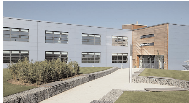
Oxford NanoLabs is based in the new purpose-built facility in Oxford, UK